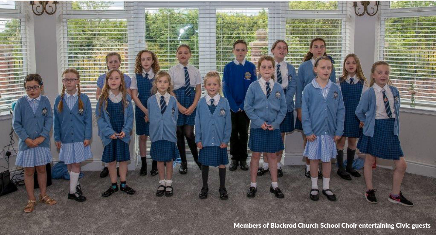
Members of Blackrod Church School Choir entertaining Civic guests

Notable Celebrations / Anniversaries If you or any member of your family are celebrating a Golden or Diamond anniversary, please inform the Town Clerk on 01204 696362 who will arrange for the Town Mayor to visit and present flowers.