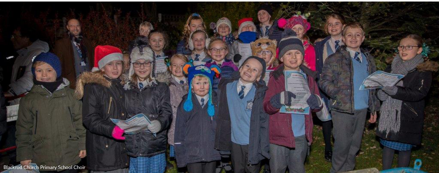
Blackrod Church Primary School Choir