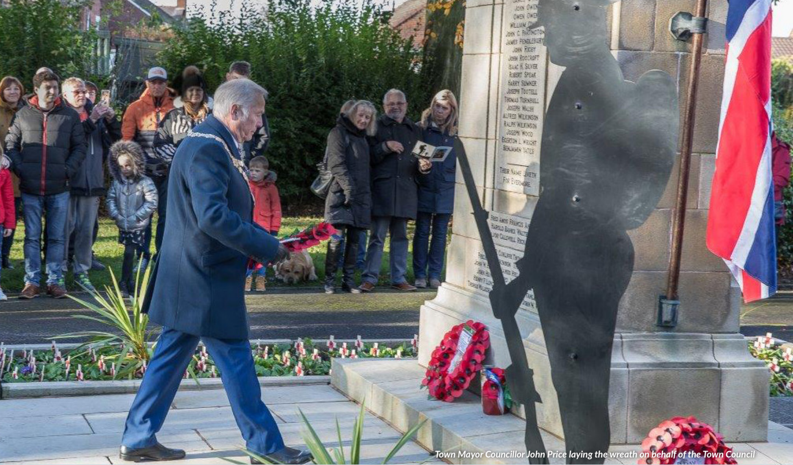
Town Mayor Councillor John Price laying the wreath on behalf of the Town Council