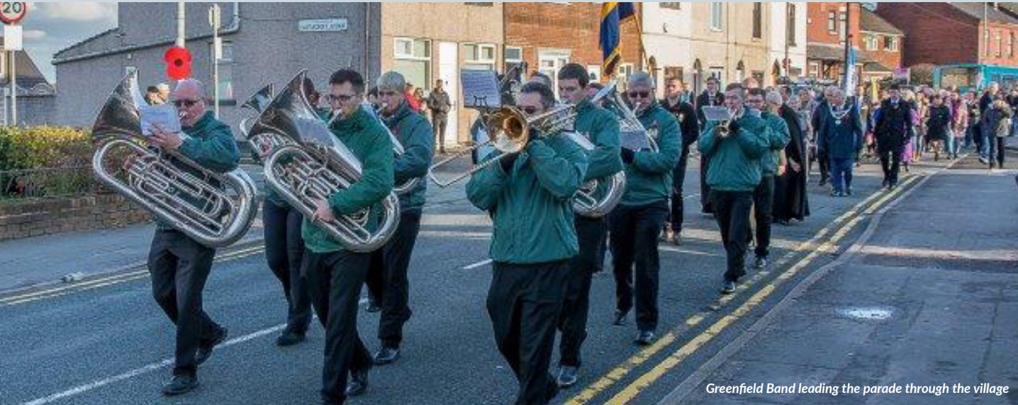
Greenfield Band leading the parade through the village

The Town Mayor of Blackrod, Town Clerk and Councillors joined British Legion representatives, the MP for Bolton, local dignitaries and representatives from many other organisations for the Annual Service of Remembrance and Parade held on Sunday 10th November 2019. The service was conducted by representatives from the three churches and hundreds of men, women and children made the march from the Cenotaph for the second part of the service, which was held in St Katharine’s Church. Following both services local residents and dignitaries were provided with warming refreshments provided by the Town Council at the Hilltops Social Club. A Maroon was also fired on Monday 11th November 2019 at 11am at the Cenotaph in Blackrod Cemetery, where children from both primary schools participated by laying their own tributes to those who had given their lives on behalf of us all.