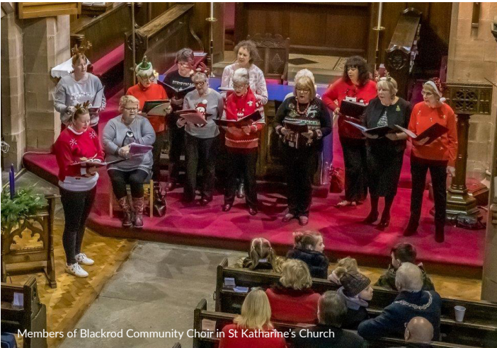
Members of Blackrod Community Choir in St Katharine's Church