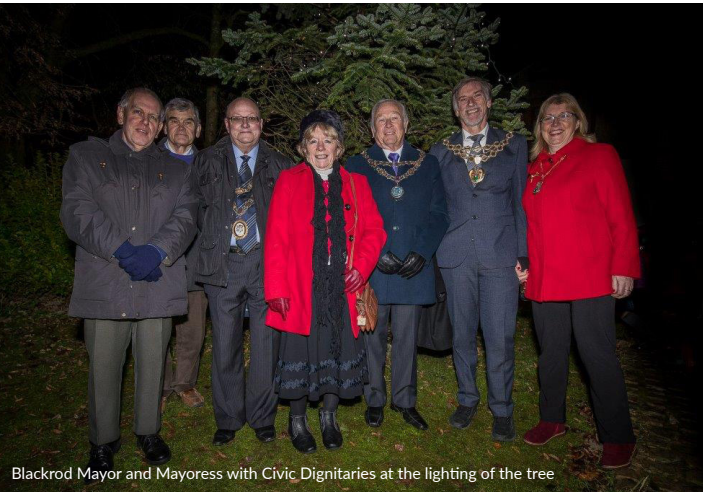
Blackrod Mayor and Mayoress with Civic Dignitaries at the lighting of the tree